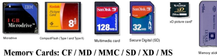
Memory Cards: CF / MD / MMC / SD / XD / MS